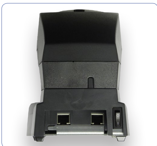
The BGR135 features a receipt printer port and on/off switch

Housed in an attractive ABS enclosure, the BGR135 is rugged, very compact and lightweight. Its quality-assured UK manufacture ensures it will withstand years of frontline use.