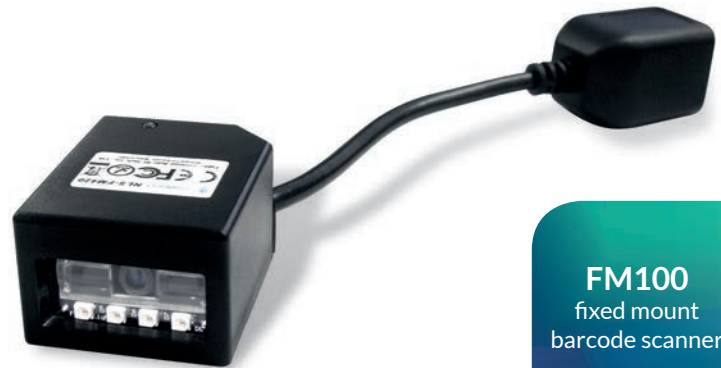
FM100 fixed mount barcode scanner