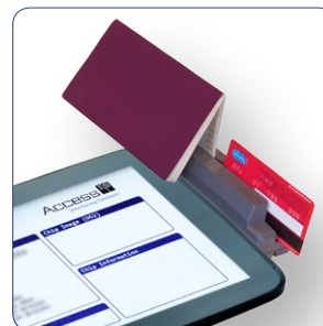
The OCR315 and OCR316 integrate well in a variety of ways with keyboards, monitors and tablets