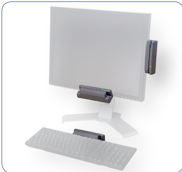
The OCR315 and OCR 316 readers can easily be attached to standard sized monitors and keyboards

Access IS 18 Suttons Business Park Reading, Berkshire RG6 1AZ, United Kingdom Tel: +44 (0) 118 966 3333 Fax: +44 (0) 118 926 7281