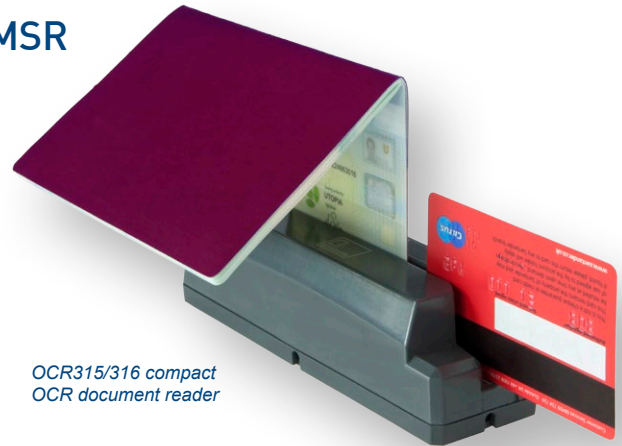
OCR315/316 compact OCR document reader

The OCR315 and OCR316 are designed and manufactured in the UK to ensure rugged, robust quality.